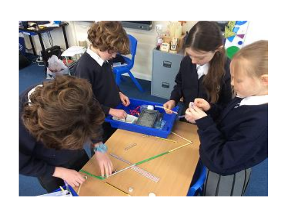
The theme of Children's Mental Health week was 'Let's connect' - so here's Fir class 'connecting' while they connect things!