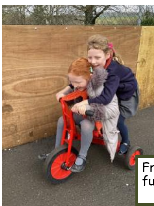
Friendship and fun at CB!